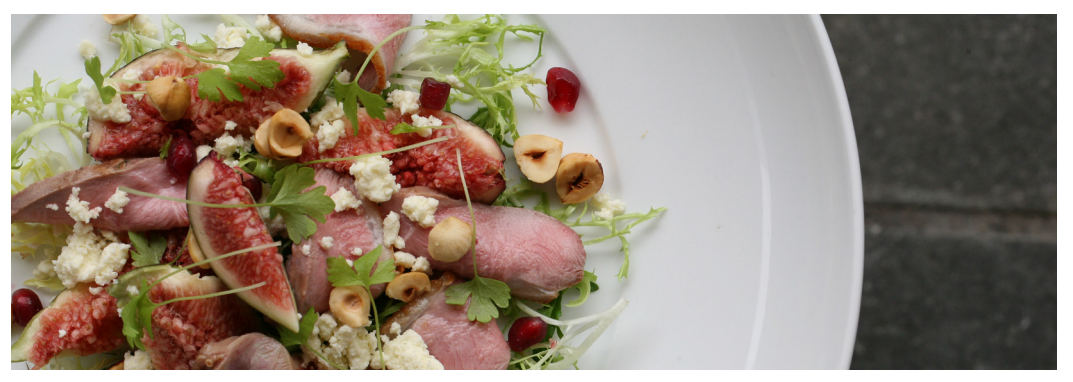
*Equipment charges may apply outside MUSE www.fortecatering.com.au/macquarie-university/ All prices are excluding GST

Alternate serve menu courses available on request