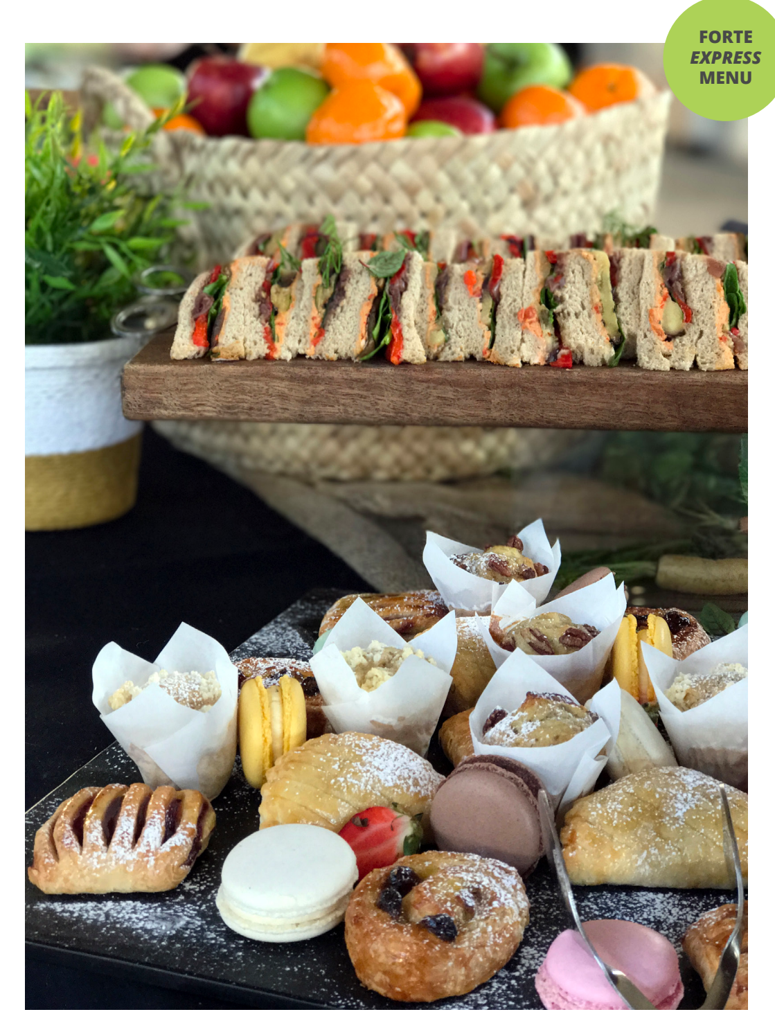
www.fortecatering.com.au/macquarie-university/ All prices are excluding GST