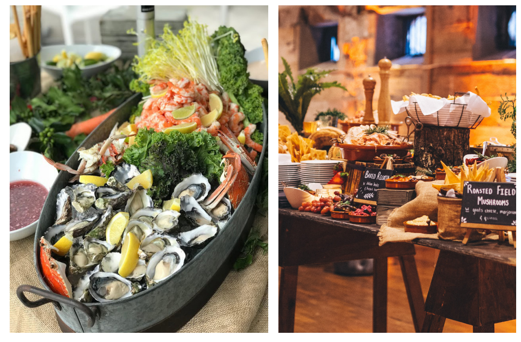
www.fortecatering.com.au/macquarie-university/ All prices are excluding GST