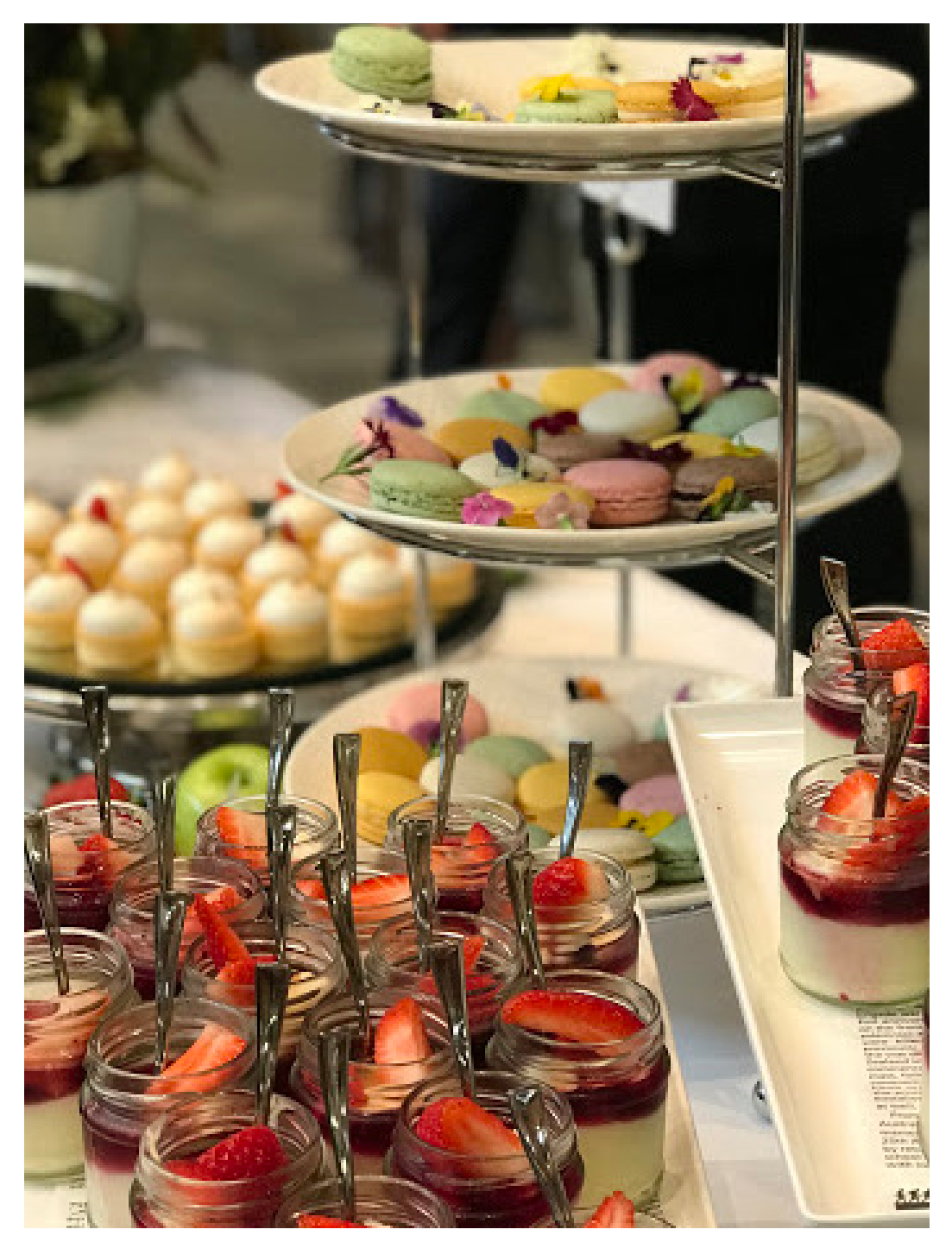
www.fortecatering.com.au/macquarie-university/ All prices are excluding GST

Forte are able to design and source all equipment and structures for your event. This includes but is not limited to linen, crockery, beverage service equipment and food station theming. Our professional Event Managers can provide a range of ideas and suggestions to create your perfect event.