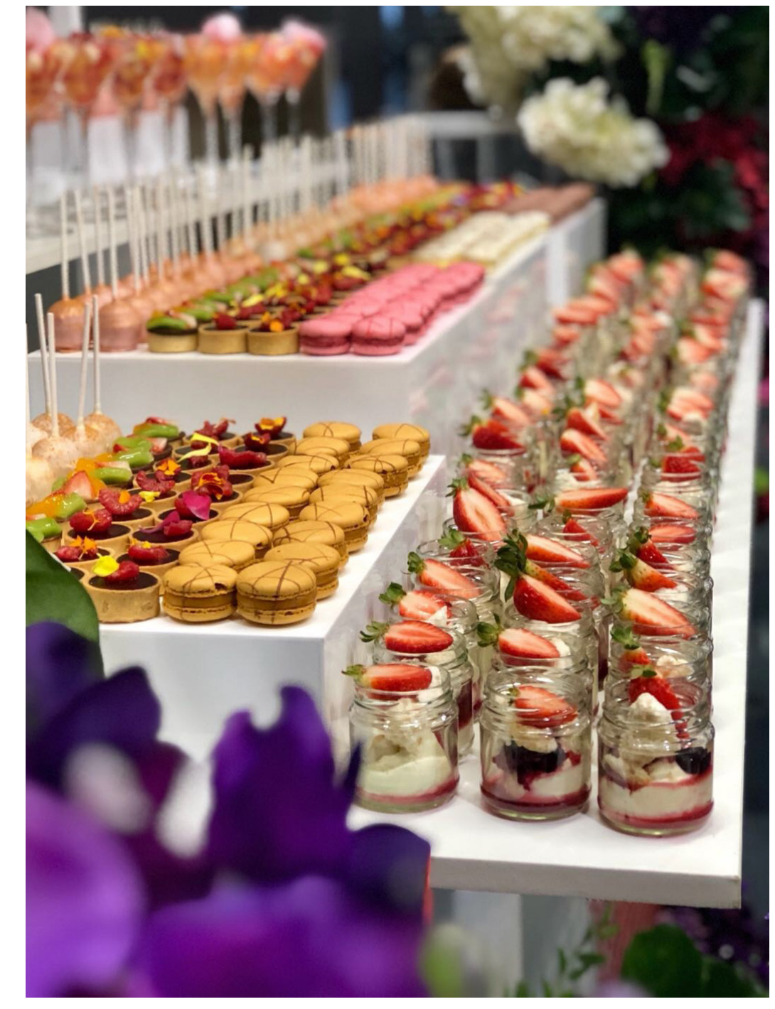
www.fortecatering.com.au/macquarie-university/ All prices are excluding GST