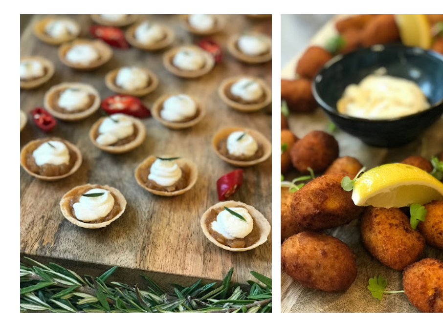
www.fortecatering.com.au/macquarie-university/ All prices are excluding GST