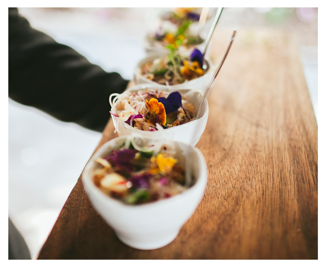
www.fortecatering.com.au/macquarie-university/ All prices are excluding GST

Chicken pad thai, vegetables, bean sprouts & roasted peanuts Spinach & ricota tortellini, roasted tomato sauce & parmesan (v) Ragu of beef, pearl barley, thyme & mushrooms Indonesian beef rendang, coconut cream, tumeric & lemongrass Malay satay chicken, toasted coconut & kaffir lime Chicken tikka masala, toasted almonds & coriander Singapore style egg noodles, crispy vegetables & chilli soy dressing (v)