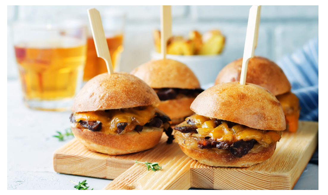
www.fortecatering.com.au/macquarie-university/ All prices are excluding GST

Korean chilli beef skewer, shredded cabbage salad & soy glaze Malay coconut chicken & roasted peanut sauce Tandoori chicken, cucumber & tomato salsa Sumac spiced lamb kofta & coriander yoghurt (gf) Tempura ocean prawn skewer w lemon aioli (gf)